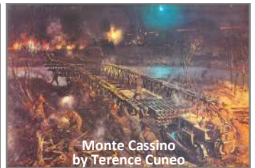
Monte Cassino by Terence Cuneo