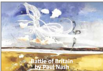
Battle of Britain by Paul Nash