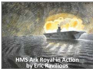
HMS Ark Royal in Action by Eric Ravilious